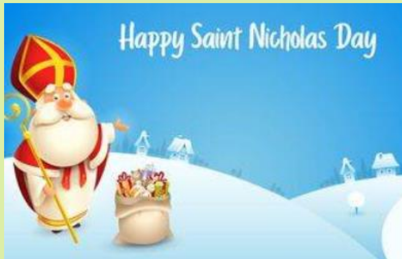
ST. NICHOLAS DAY