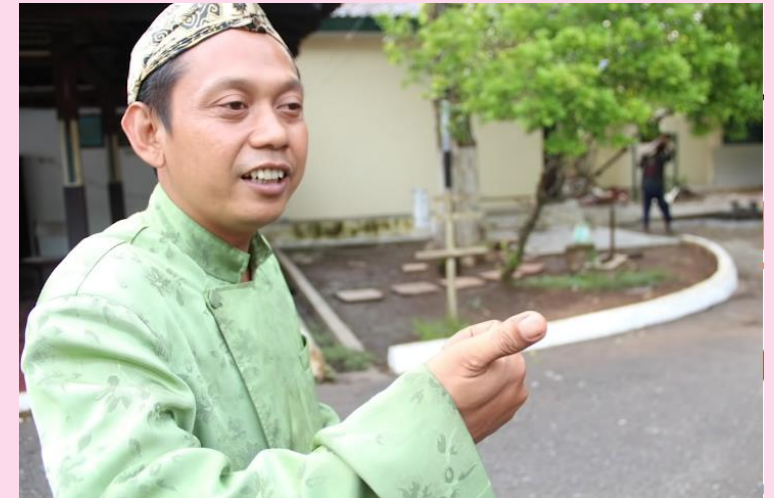
IN INDONESIA PEOPLE POINT WITH THEIR THUMBS

ALL OF THOSE THINGS ARE UNIQUE TO THE CULTURES THAT DO THEM AND ARE A PART OF WHAT MAKES THOSE CULTURES SPECIAL.