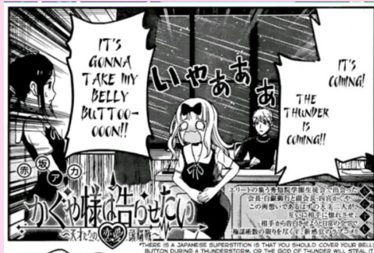
JAPANESE CHILDREN COVER THEIR BELLY BUTTONS WHEN THEY HEAR THUNDER