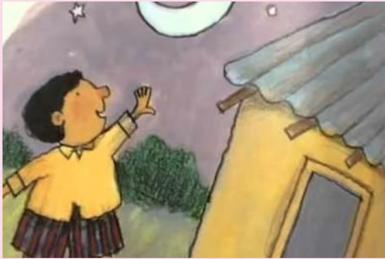
IN GREECE A CHILD THROWS A LOST TOOTH ON TO A ROOF FOR GOOD LUCK