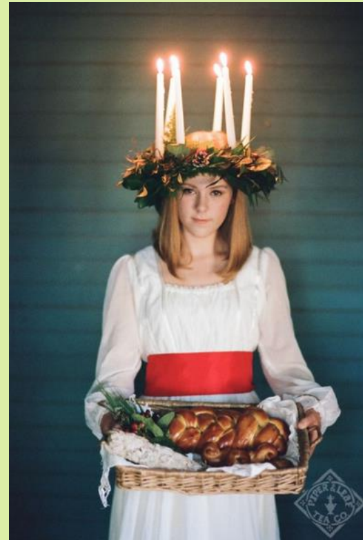
ST. LUCIA DAY