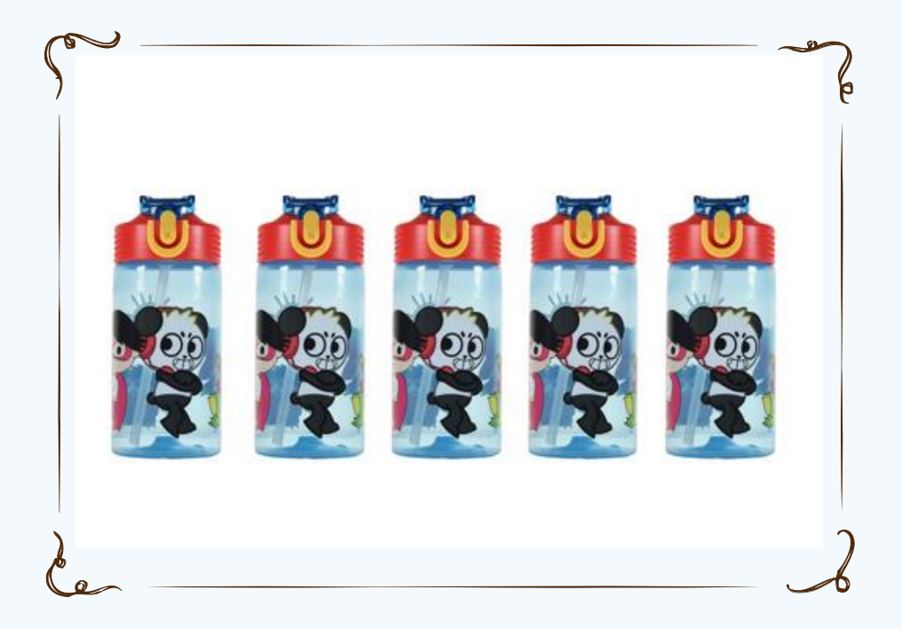
They are all exactly the same and identical which makes none of them really special

It has your name It has your favorite animal It is thoughtful