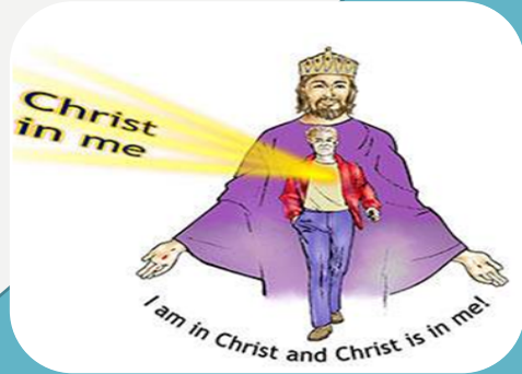
Abiding in Christ