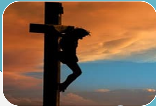
Salvation & Remission of sins