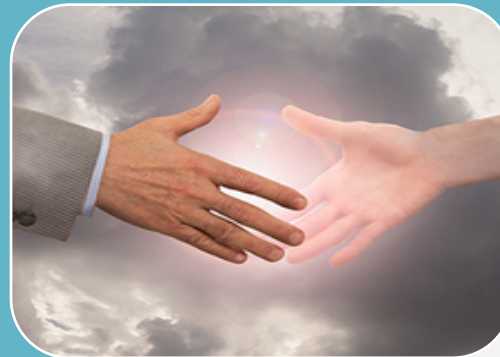
Covenant with God