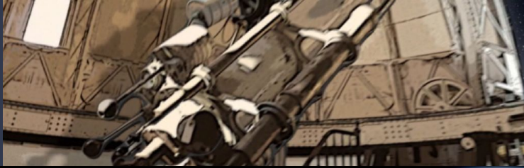
Hubble looks for missing matter